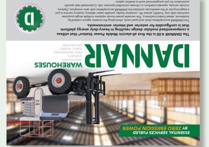
DANNAR Built for Warehouses