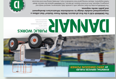
DANNAR Built for Public Works