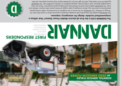
DANNAR Built for First Responders