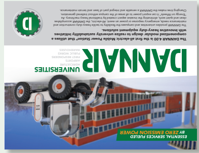
DANNAR Built for Universities