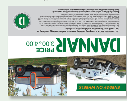
DANNAR Price Sheet